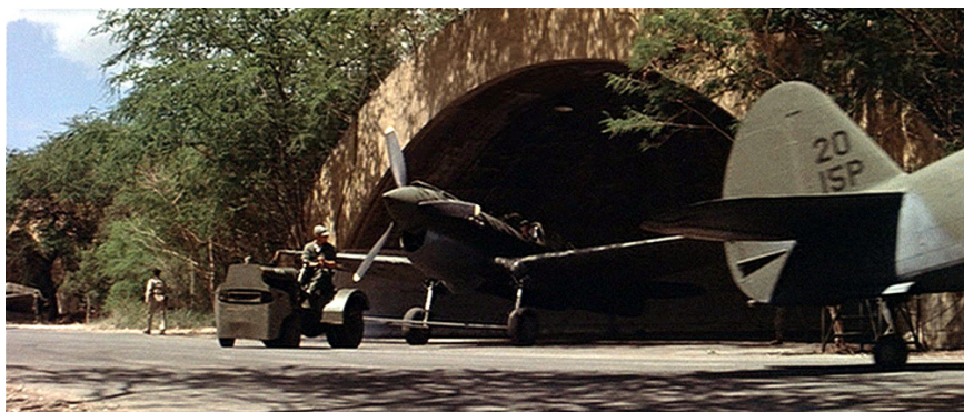
"Tora, Tora, Tora" 20th Century Fox